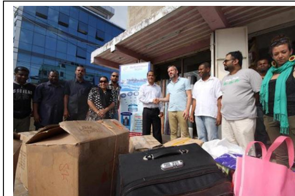
Charity clothes were received from Saidia Zanzibar