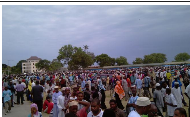
Crowd at Maisara – 1 st day of tragedy