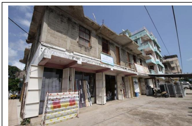
Mlandege 'kwa Gharib Mapazia'

5 th day – ZOP has started registering the missed passengers at 4 centres;