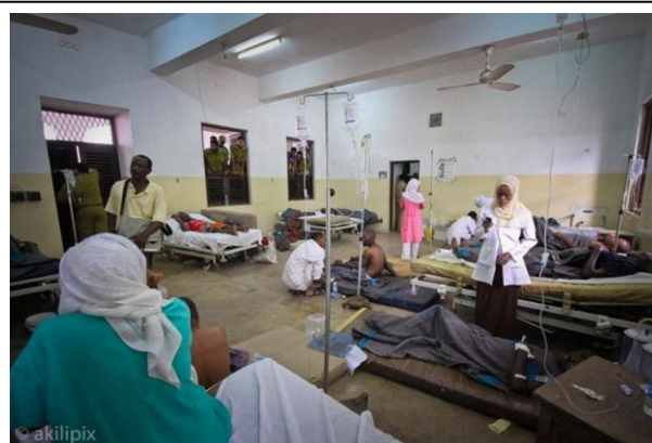
Inside the ward at Mnazi Mmoja hospital