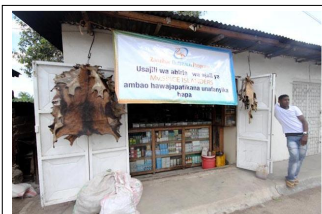
Bububu school 'kwa abuwalad shop'