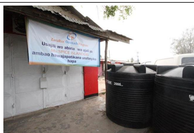
Mwanakwerekwe roundabout – Kwa Marshed