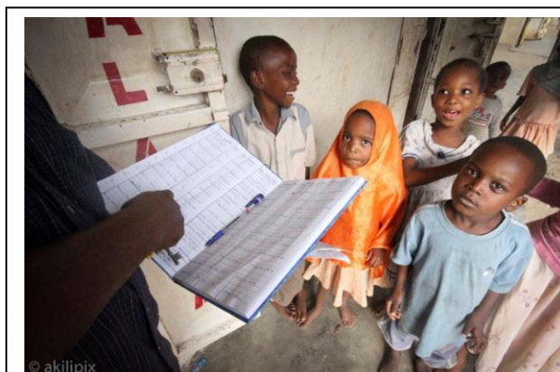
One of the ZOP's registration points

The following is what has been deposited/ received by ZOP on emergence relief efforts: