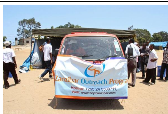
ZOP's vehicle was used for supplying water and refreshments from Mnazi Mmoja hospital to Maisara ground